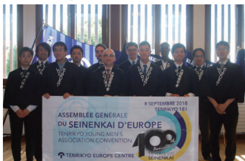
Europe Chapter (September 8, 2018)