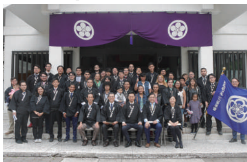
Mexico Chapter (June 30, 2018)