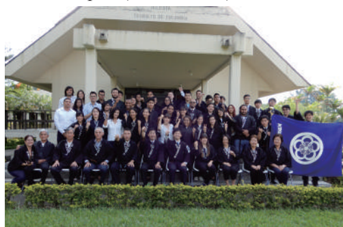
Colombia Chapter (June 16, 2018)