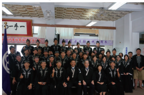
Taiwan Chapter (September 16, 2018)