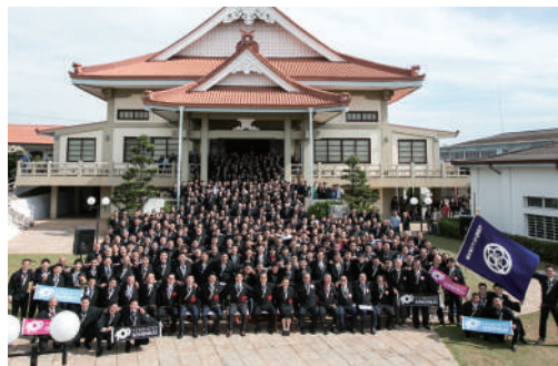
Brazil Chapter (June 9, 2018)