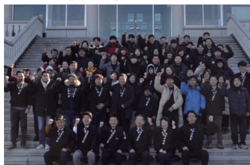
South Korea Chapter (December 9, 2018)