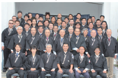
America Chapter (June 16, 2018)