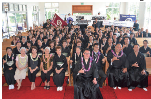
Hawaii Chapter (May 19, 2018)